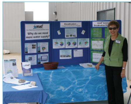
Community informational meetings and events help the public learn about the proposed scwd 2 Regional Seawater Desalination Project

For more information visit www.scwd2desal.org and sign up to receive monthly email updates.