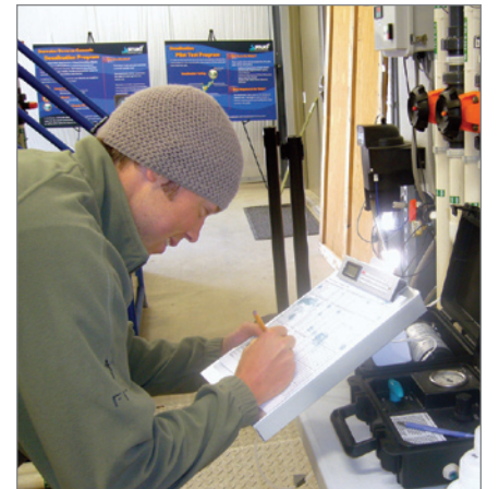
The SWRO Desalination Pilot study was conducted March 2008-April 2009 at Long Marine Laboratory in Santa Cruz

Additional studies will also be conducted as part of the preparation of the project EIR. The EIR schedule graphic shows how the technical studies will inform the EIR process.