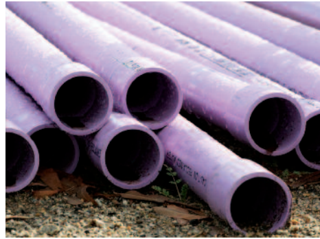
Purple pipe is used to convey recycled water for irrigation and other non-potable uses.

Recycled water is generally used as an alternative to using potable (drinking) water for irrigation purposes or for groundwater recharge programs in which