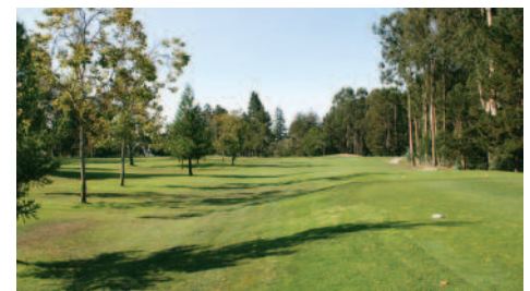
Evaluation on watering Pasatiempo Golf Course with recycled water is underway.

Under current California regulations, highly-treated wastewater (recycled water) is not permitted for discharge into a potable water distribution system (otherwise known as direct potable use). While it may be used to provide irrigation water for parks, sports fields, and/or golf courses, this would require new dedicated distribution pipes that have shown to be prohibitively expensive compared with the relatively small volumes of water delivered. In addition, during drought conditions, water restrictions are established for outdoor irrigation and therefore recycled water would not meet the City’s potable water needs during these times.